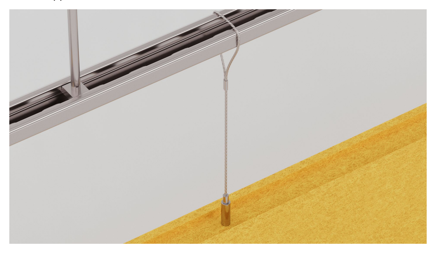
Direct mount to Unistrut with Bolt (male), Coupler, Washer, and Screw